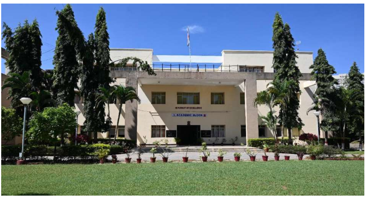
"Nurturing Future Leaders in Global Hospitality"