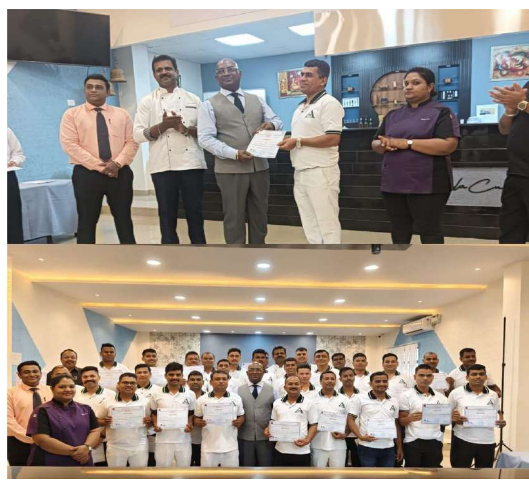
Culinary & Bakery Workshop & demonstration sessions held for Airforce Cadets during the AY – July /Aug 2023-24