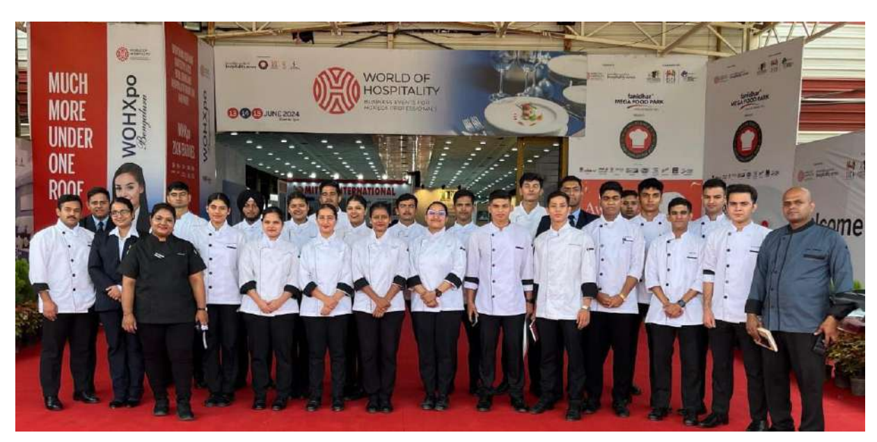
Our Students attended the Hospitality Expo organized by HoReCa Association - June 2024