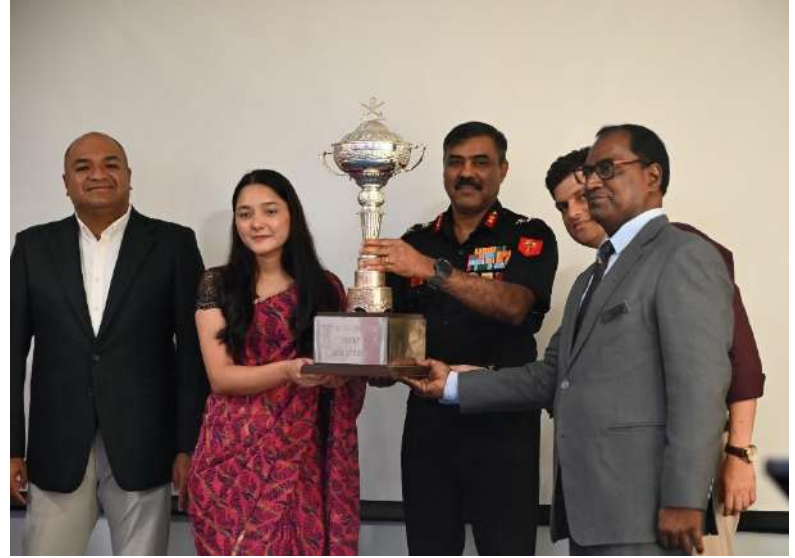
24<sup>th</sup> course students receiving the trophies for excellence in the core areas during farewell ceremony held on 27 Jul 2024.