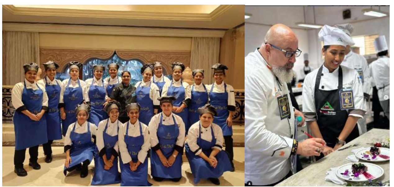
Students of AP School, PRTC and AWWA had visited our Millet Expo - August 2023